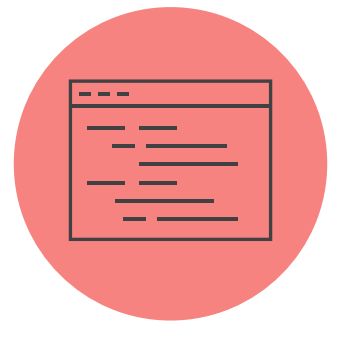
Planning the right content for the right users across touchpoints